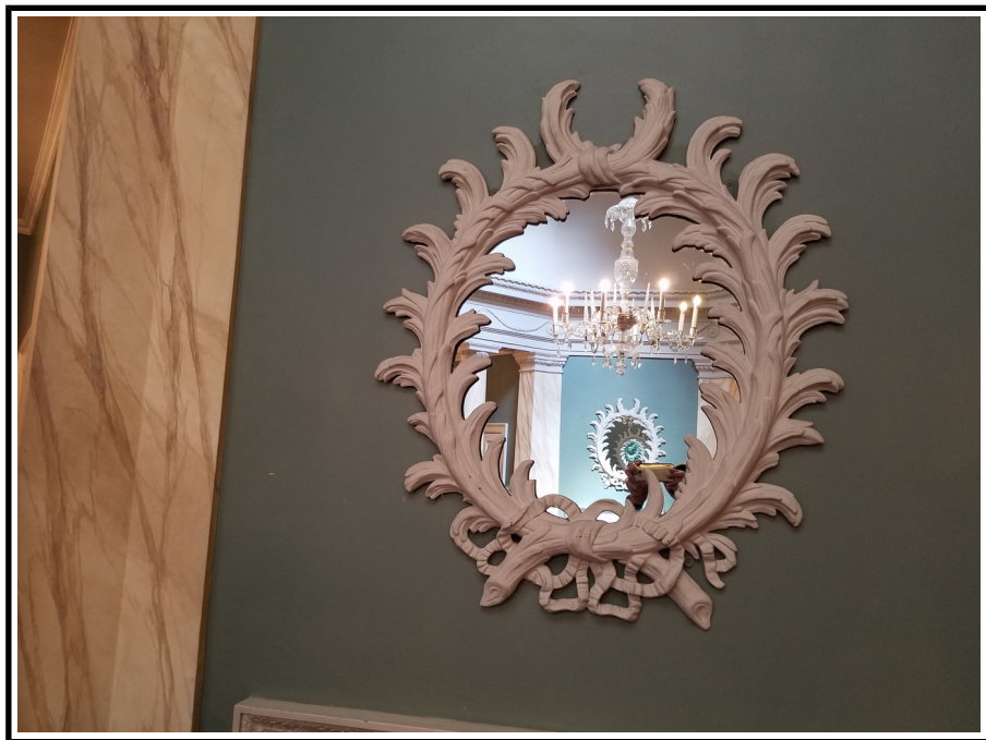
Multiple Reflection "selfie" in Assembly Rooms, Bath UK