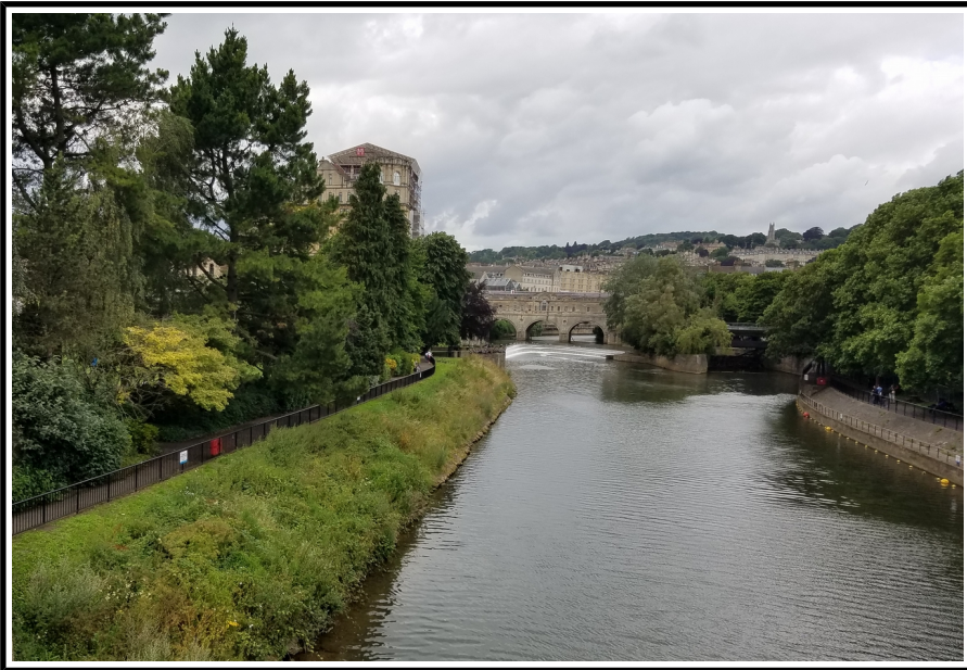
Looking up the Avon River towards Pulteney Bridge and Pulteney Weir from North Parade bridge, Bath, UK