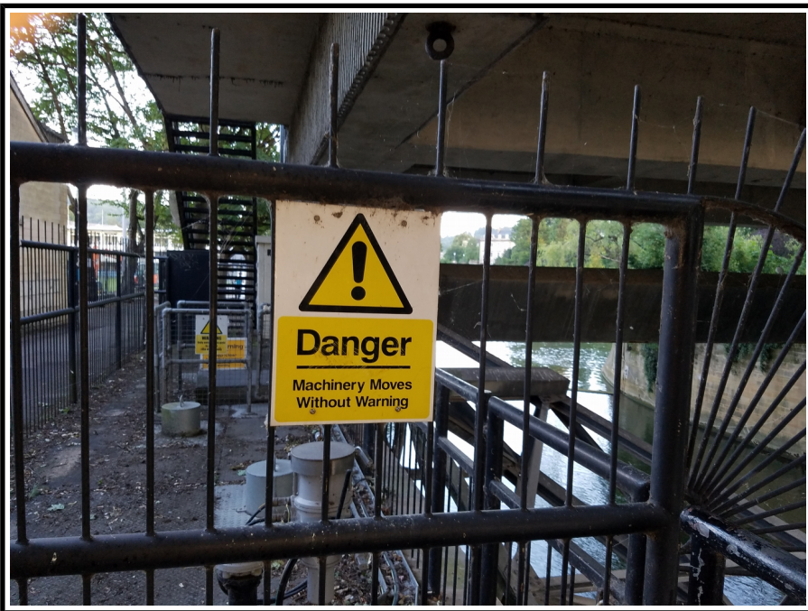
Walking up the Avon river after crossing the North Parade bridge on July 10, we found this ominous sign on some machinery of unknown purpose by the side of the river. After hunting a bit on the WWW when we got back home, it is apparently some relic of earlier canal technology still actively used for Avon River water level control to sustain the Pulteney Princess tour boat's operations.