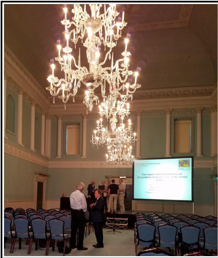
Jean captured this image of the INRC 2016 meeting at a break July 14, 2016 in its Bath UK Assembly Rooms hall