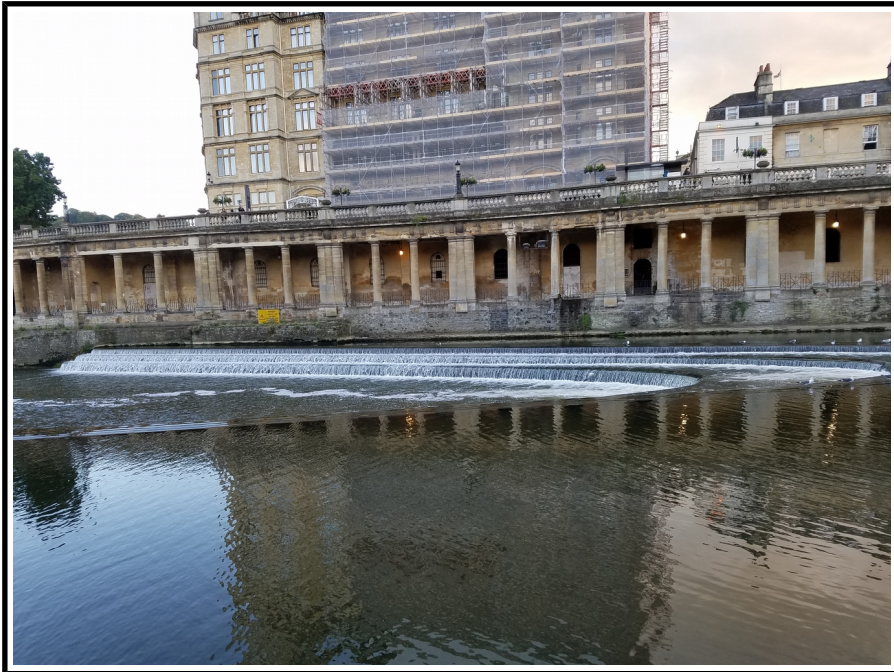
Walking just a few feet further from the ominous warning sign, we captured this image of Grand Parade across the Pulteney Weir from the other side of the Avon River.