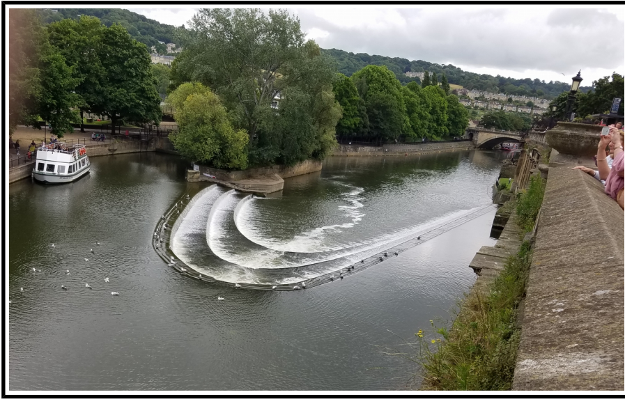
Avon River Pulteney Weir & the Pulteney Princess tour boat, Bath, UK looking down river away from Pulteney Bridge). Checking on the WWW this is the turning basin for one end of its many hour long round trips taken each day.